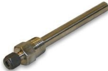
Bore throw connector with thermowell