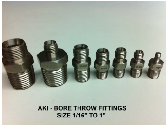
AKI - BORE THROW FITTINGS SIZE 1/16" TO 1"